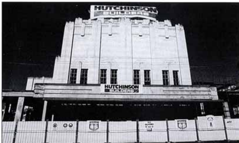
Hutchinson Builders get star billing at the Empire Theatre in Toowoomba.