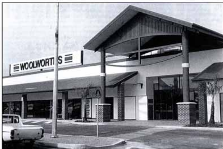
Urangan Central in Hervey Bay

Only one vacancy remained on the building's completion.